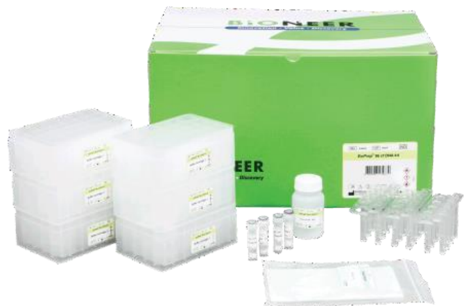
ExiPrep™96 Viral DNA/RNA Kit