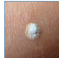
IMMEDIATELY AFTER TREATMENT