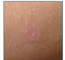
TWO WEEKS AFTER TREATMENT