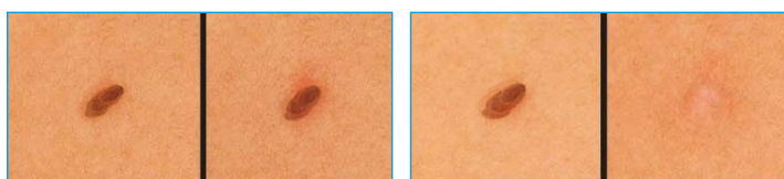
Before After Day 7 Day 14