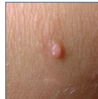
COMMON WART BEFORE TREATMENT